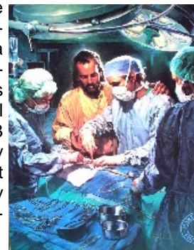
Best Care Anywhere

No, that is not a typo. You might have thought "insurance". We think it is assurance. Healthcare has not been a financial priority for the average Dominican family. The economic conditions there have worsened in the past several months. Inflation during the last 3 months has been over 100%. Many families are working all day just to put one meal on the table. Discretionary money in the household budget is non-existent. The results: Dominicans cannot afford healthcare.