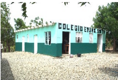
Jim Smith School at El Rosario

We are pleased to announce a sponsorship program for the Jim Smith School in El Rosario. This school is a small Christian school located in the small town of El Rosario, which is located about fifteen miles southwest of San Juan. There are approximately 114 students in the school in five grades. Funding for the school is almost non-existent. There is a small amount of funding that barely buys food for the students to get one good hot meal each school day. The school currently has a half-day session with the ability of doubling their size by adding an afternoon session. The sad part is the school has no funds to pay their teachers or to purchase books and supplies.