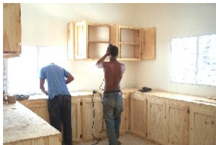
The Cabinets Are In Place

As time goes on, the excitement is growing about the opening of the new clinic in El Cercado. The project is rapidly coming to a close. The finishing touches are being completed, cleanup is