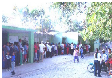
30,000 people treated last year at the current facility in San Juan.