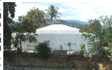
The New Clinic In El Cercado

The finishing touches are underway on the clinic in El Cercado. Several teams have worked there this winter. The roof has been completed, painting done, concrete poured, doors built and the list goes on. There are still many little details to complete. We are hoping to have the building in operation in late spring/early summer. Thank you for your help with the labor of love and of funds to complete this building. We hope to have details concerning its opening in our next newsletter.