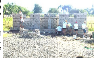
The New Restrooms For The School

We will be working with a Christian engineering organization on building design in the very near future. The preliminary plan calls for this facility to become a mini-hospital, providing for overnight stays for surgical patients, emergency services, rooms for other specialties, and residence training for new doctors and other medical personnel. This facility will replace the current facility that was flooded by Hurricane Georges in 1998. The new site is located outside of the flood plain. Please continue to watch future newsletters for more information on construction plans.