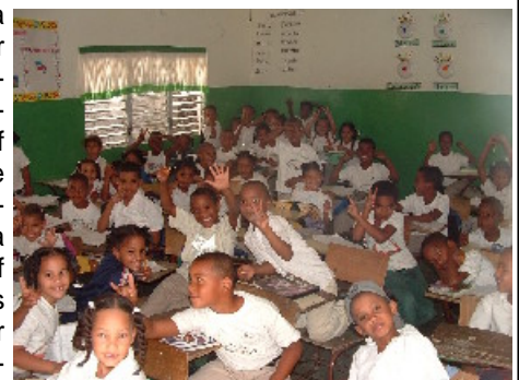
One of the many overcrowded classrooms in the Dominican Republic.

If you are sponsoring a student, thank you for the life changing education you are providing your student. If you are not, please consider this opportunity to really make a difference in the life of a young child. It costs $24 US per month or $288 per year to provide a child with an education in a Christian school, books and supplies, medical attention, a uniform and a hot meal each school day. That is only 79 cents a day. You can select a child on our website or call us at 419-335-8046 for more information on how you can help give a child hope and a gift that will last a lifetime.