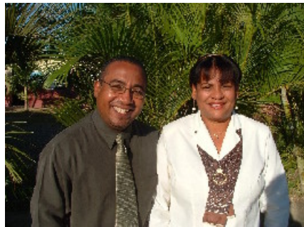
Please pray for the leaders serving on the frontlines