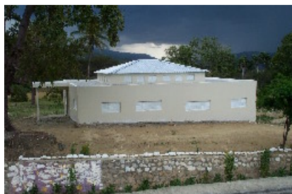
Just About Finished

Last year's project raised just a little over $25,000 for the new clinic construction in El Cercado. The opening of that facility is just weeks away. There are a few finishing touches being completed. Equipment has already been moved in and personnel are getting excited. As we finish up the project, leftover funds will be used to furnish the facility. We are working on the budget for the new facility as well as working on some supplemental funding to help our Dominican friends to operate the facility. Please pray that God will use this facility to